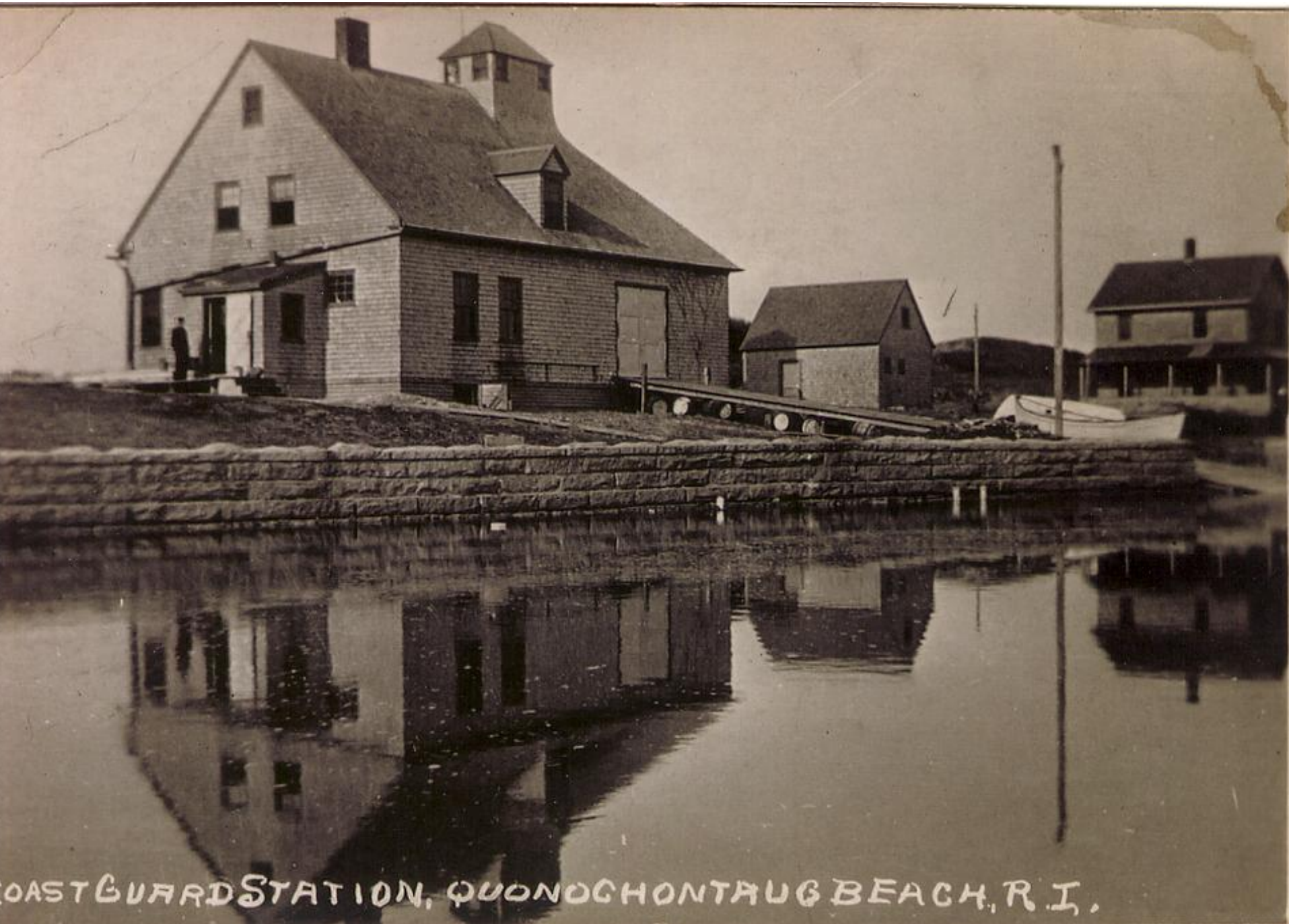
COAST GUARD STATION, QUONOC HONTAUG BEACH, R. I.