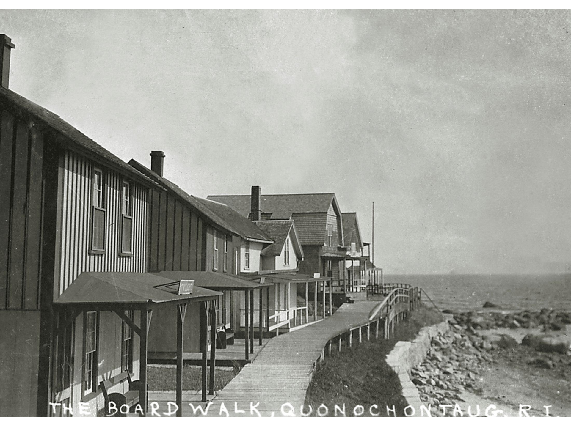
THE BOARD WALK, QUONONCHONTAUG, R.I.