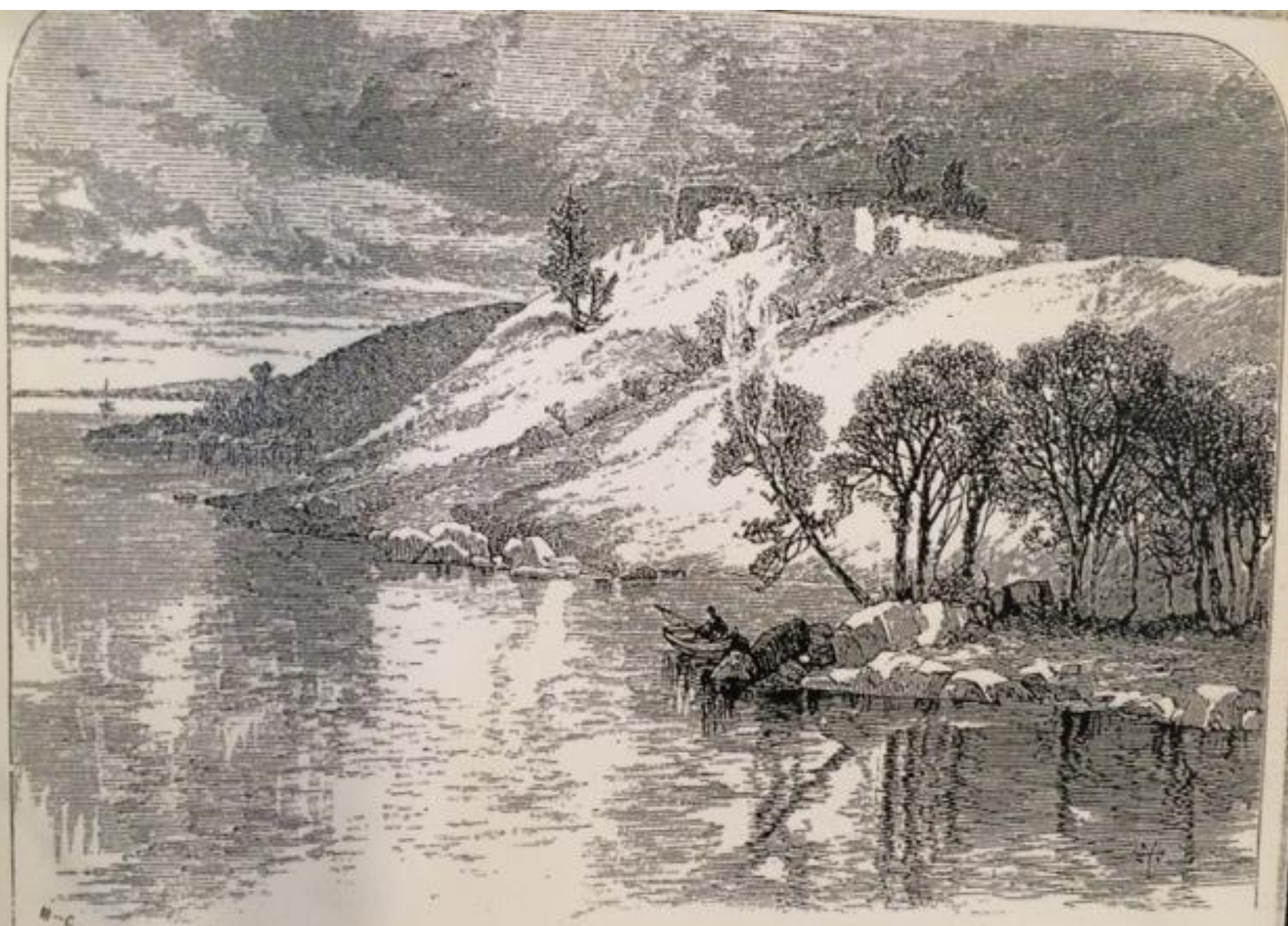
Site of the Narragansett Fort at Fort Neck.