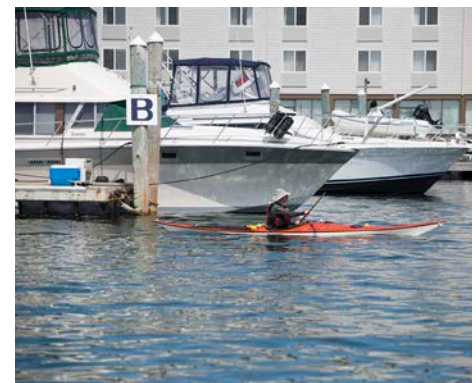
The many uses of Rhode Island’s coastal waters are the focus of a social science research project.

Take a closer look at the projects by visiting seagrant.gso.uri.edu/research/2014-2016/