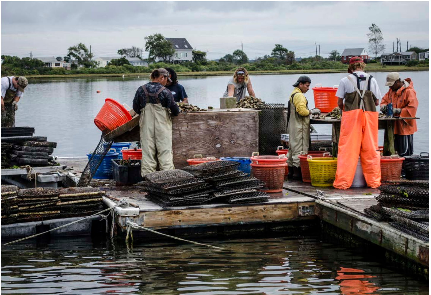
Workers at Matunuck Oyster Farm sort oysters from Potter Pond that supply the Matunuck Oyster Bar and are distributed across the country.

citizens try their hands—equipped with mudrakes—at shoreline quahogging, digging for clams along muddy flats while expert shellfishermen shared their expertise, lore, and tips of the trade. The activity built momentum for the SMP, even as it fostered new appreciation for the habitats and industries that support shellfish.