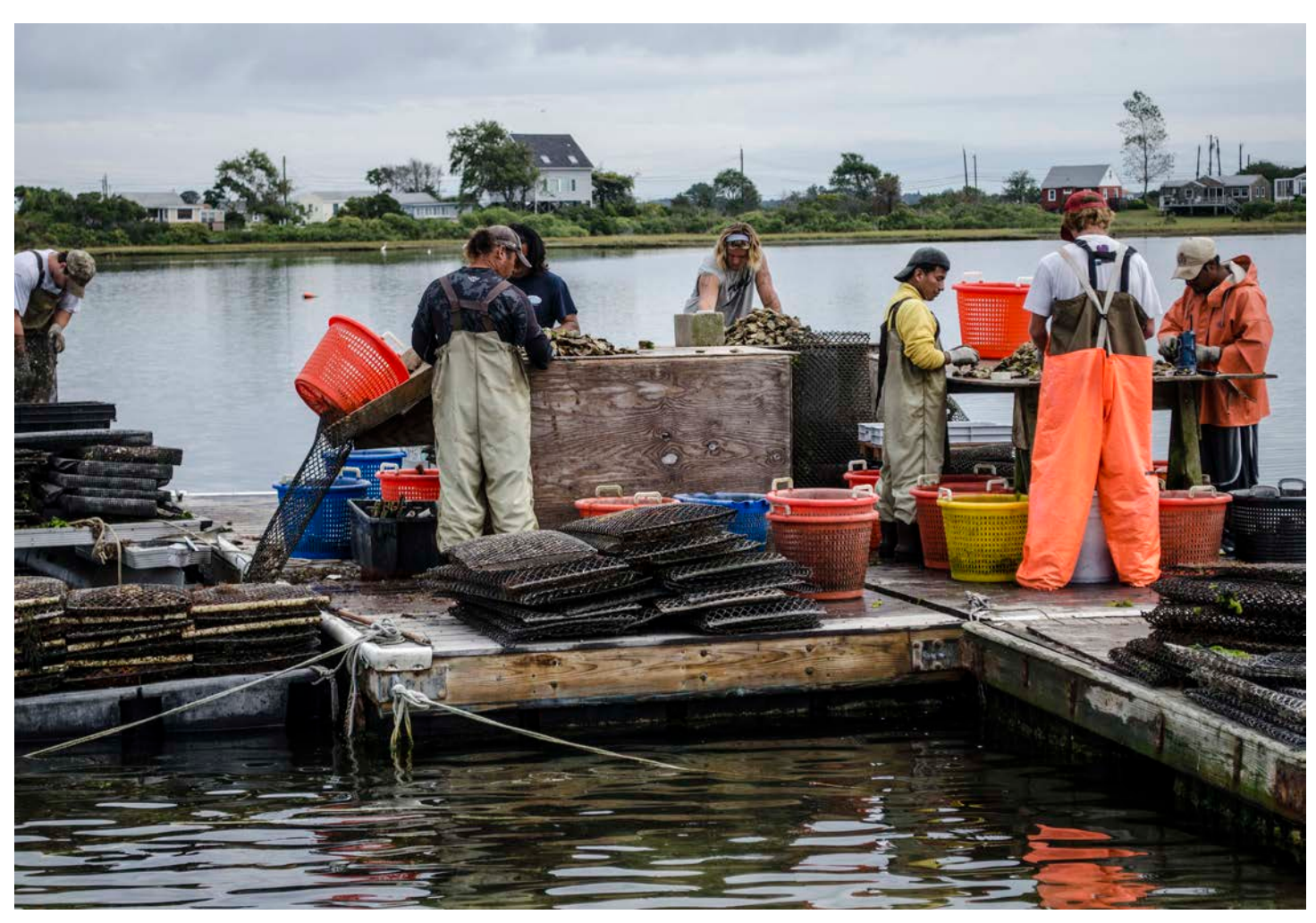
Workers at Matunuck Oyster Farm sort oysters from Potter Pond that supply the Matunuck Oyster Bar and are distributed across the country.

citizens try their hands—equipped with mudrakes—at shoreline quahogging, digging for clams along muddy flats while expert shellfishermen shared their expertise, lore, and tips of the trade. The activity built momentum for the SMP, even as it fostered new appreciation for the habitats and industries that support shellfish.